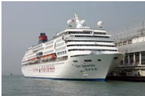
Star Cruises – 2.4m C-band