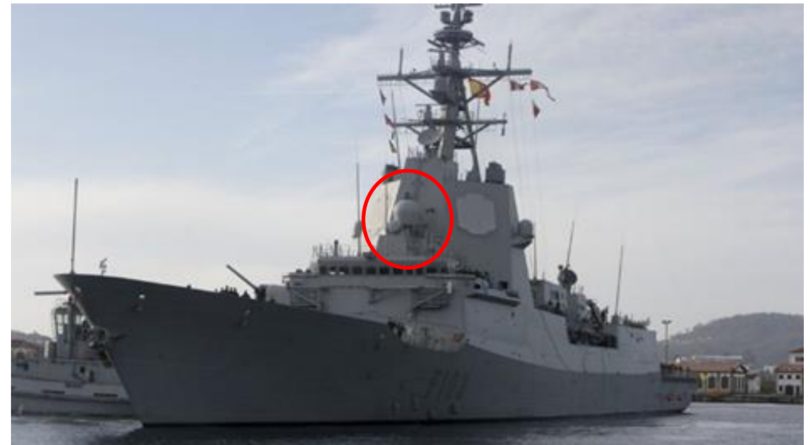
Indra – 1.8m X/Ka-band installation on Spanish Frigate