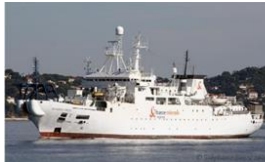
FT Marine – 1.2m Ku-band