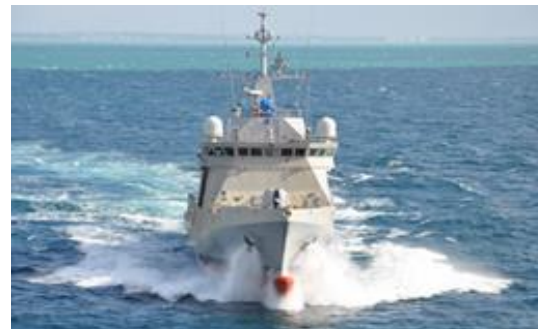
X-Sat/Indra – OEM 2.2m X-band